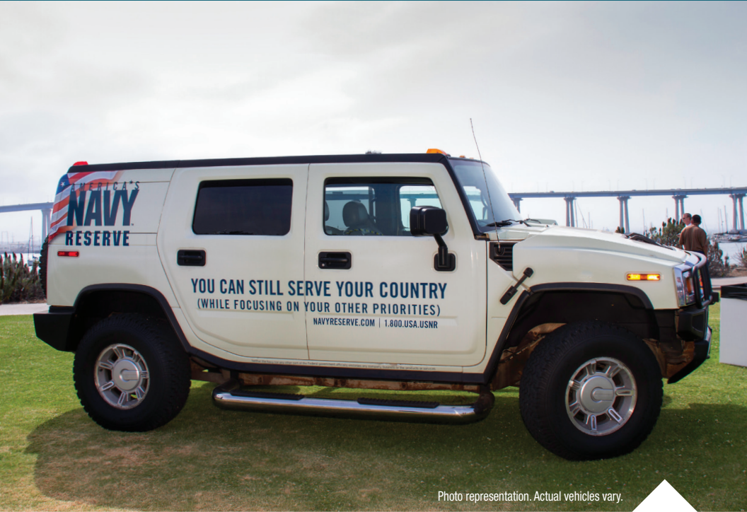
Photo representation. Actual vehicles vary.