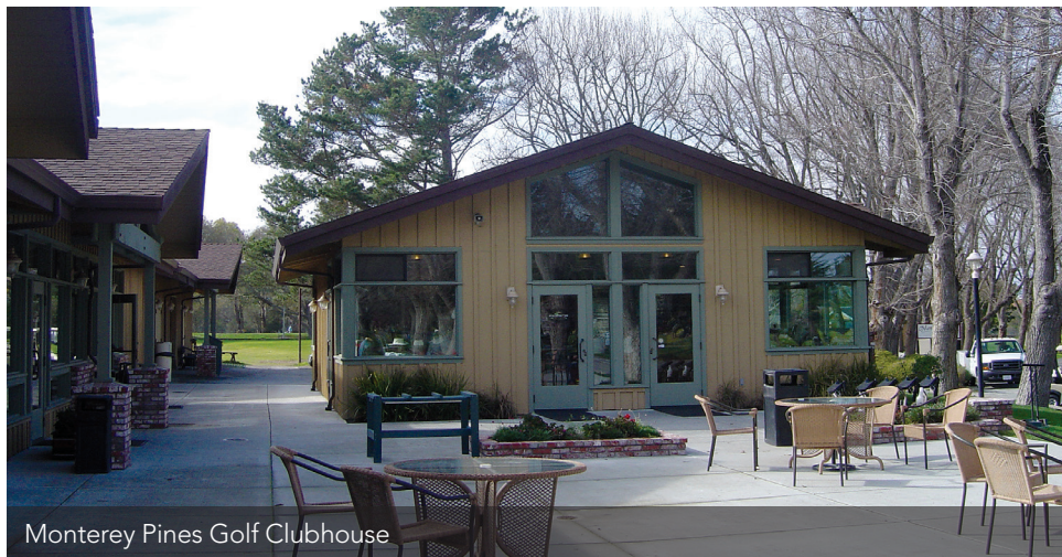
Monterey Pines Golf Clubhouse

*ALL PROMOTIONAL MATERIALS MUST BE APPROVED BY MWR AND PROVIDED BY ADVERTISER*